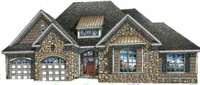
7330 N. Beau Avenue, Milw